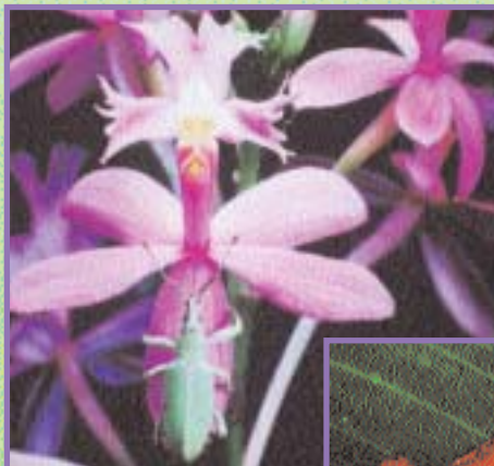
A weevil on an orchid

Our first stop today is the lowland Aripo Savannah en route to the eastern coast and Nariva Swamp, the island's largest freshwater herbaceous swamp. In this area of extremely acidic soil with poor drainage, we search for new species including Orange-winged Parrot and Squirrel Cuckoo. Continue to Nariva Swamp, where islands of Moriche Palm line its banks. During our journey we hope to see species such as Savannah Hawk, Red-breasted Blackbird, Southern Lapwing, White-headed Marsh-Tyrant, and Green-rumped Parrotlet. At the marsh we look for Pinneated Bittern, Pearl Kite, Wattled Jacana, Blue and Yellow Macaw, and Crimson-crested Woodpecker. We may also glimpse Red Howler and Capuchin monkeys and Giant Anaconda in the forest. At dusk, we wait to see flocks of Red-bellied Macaws returning to their nighttime roosts.