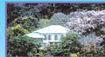
Asa Wright Centre

The Asa Wright Nature Centre and Lodge is a beautiful 24-room lodge and wildlife sanctuary located in the midst of a lush rain forest in northern Trinidad. Formerly the estate house of the former plantation, the centre's main lodge is a gathering place for guests throughout the day and evening, and the lodge's verandah offers up-close viewing of an incredible variety of birds that live in the surrounding rainforest. Guests also enjoy high tea in the afternoon and complimentary rum cocktails in the evening as the sun sets over the Arima Valley. Guest accommodations are comfortable twin-bedded rooms, each with a private bath. The centre has a natural grotto on a free-running rainforest stream, providing a relaxing escape from the tropical heat. Delicious meals reflect the diversity of the local cuisine, which is a mix of West Indian, Creole, Oriental, Indian, and European dishes, and served family-style in the centre's dining area.